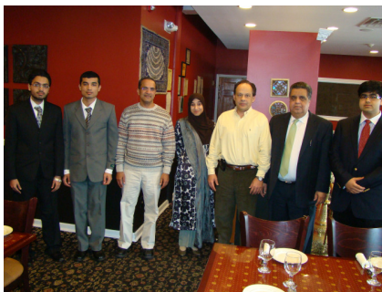
NEDATS Scholarship 2010 Recipients and Sponsors

consult, Inc and a sponsor of NEDATS scholarship, reiterated that higher education provides opportunities to explore talents and develop leadership in individuals. By providing scholarship towards higher education, he wants to share the responsibility to help his extended NED family to excel in field of education. Each sponsor appreciated the hard work put by NEDATS in the selection of candidates